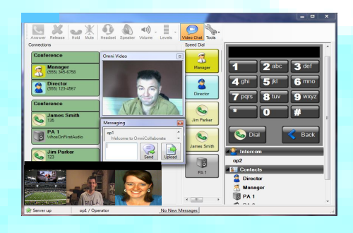
Secure collaborative suites