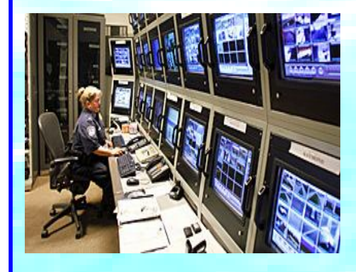
Public safety command communication