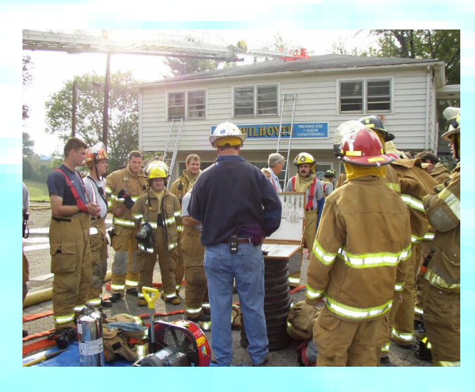
First responders interoperable communication